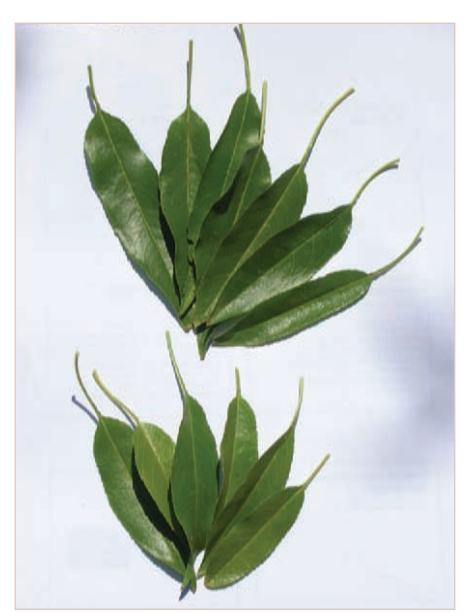
Figure 2: Photo from 2006 (Top) Improved almond leaf size - CT Trial; (Bottom) Smaller almond leaf size - Conventional nutrition program

This Fact Sheet proposes new standards for nutrient concentrations in leaves sampled in October, November, December and the traditional January timing.