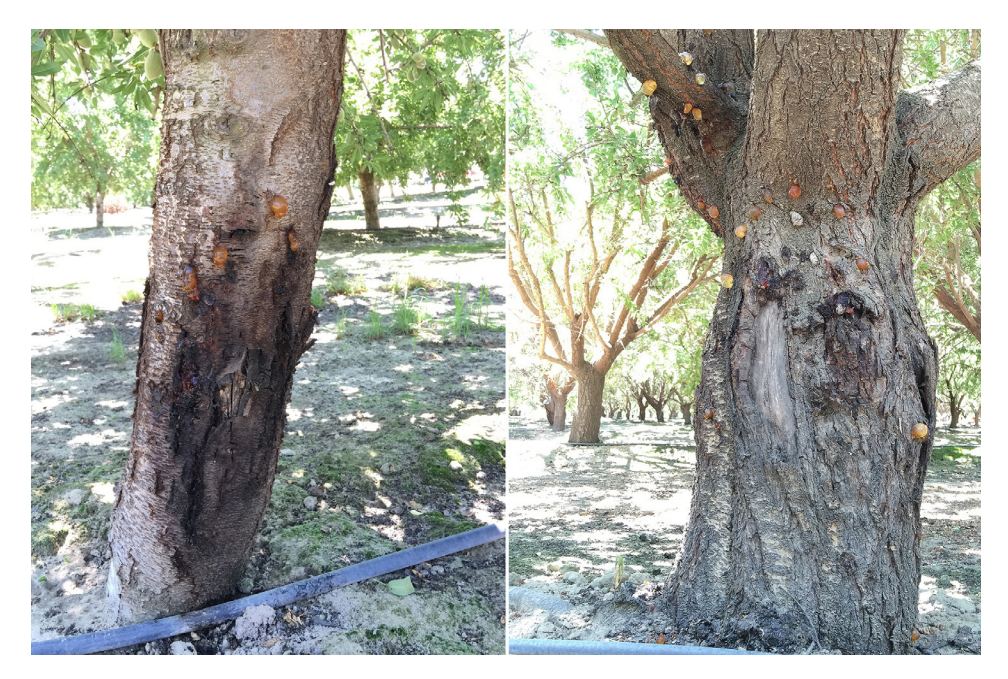
Water-soaked injury on a young tree with darker center than the surrounding healthy tissue (left). Symptoms of an established infections with amber-colored gumballs that are produced around the margin of the canker (right).

disease and start as water-soaked injuries that are darker than the surrounding healthy tissue. Symptoms of established infections include amber-colored gumballs that are produced around the margin of the canker, where the fungus is most active. The cankers are perennial, persist over several years, and are most active during the growing season. Ceratocystis cankers are associated with shaker injury on the trunk and pruning wounds on the scaffold. Bark injuries and pruning wounds are susceptible for up to 14 days.