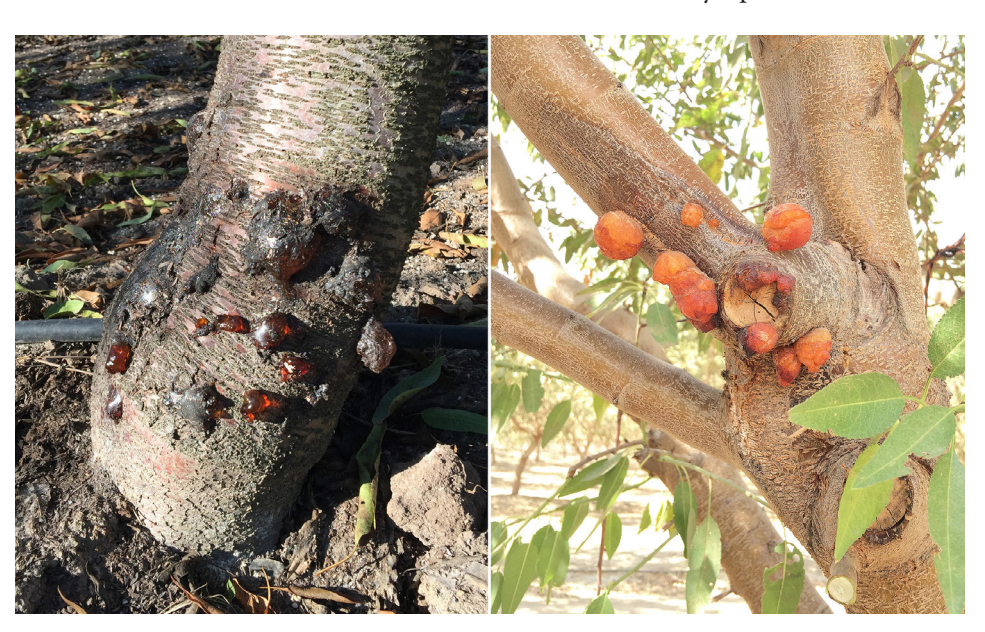
Infection by a Botryosphaeriaceae species with gumming at a pruning wound made for the selection of secondary scaffold (right). Band canker with oozing of amber sap that forms in a ring around the circumference of the tree (left).

Ceratocystis canker caused by the fungal pathogen Ceratocystis fimbriata is a common disease of almond in California. While this disease is generally associated with shaker damage and bark injuries of trunks during harvest, C. fimbriata is also capable of infecting branches from fresh pruning wounds and if left untreated can kill branches, scaffolds and entire trees. Ceratocystis is spread by several species of sap-feeding beetles and fruit fly. This disease is unique to California almond production systems and thus far has not been found