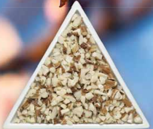
Roast Diced Natural