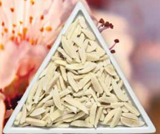
Roasted Blanched Slivered