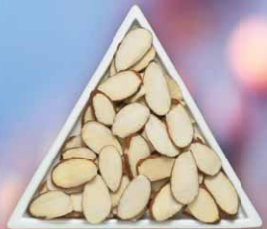
Roasted Natural Sliced