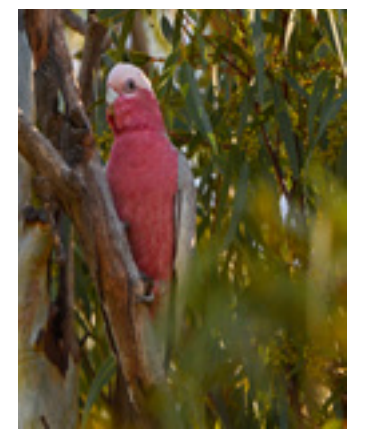
Figure 9. Galah