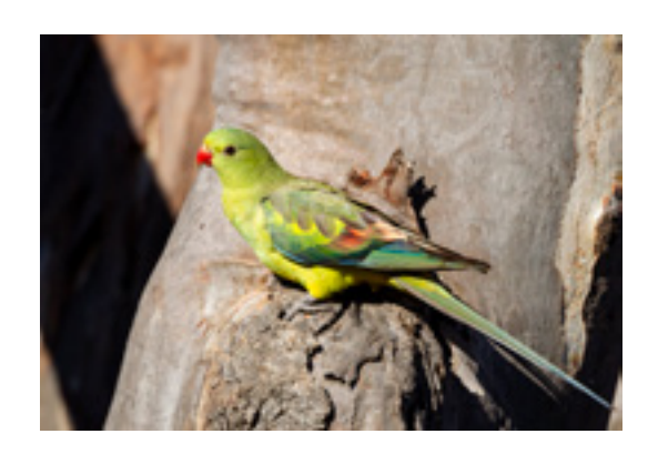
Figure 7. Regent Parrot (protected species)