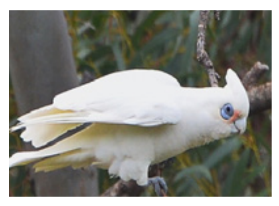
Figure 6. Little Corella