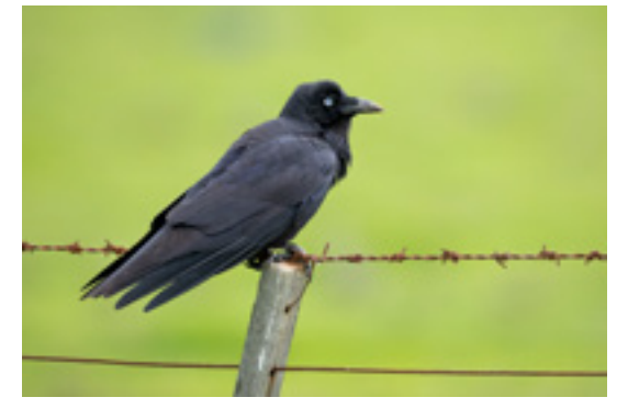
Figure 5. Little Raven (crow)