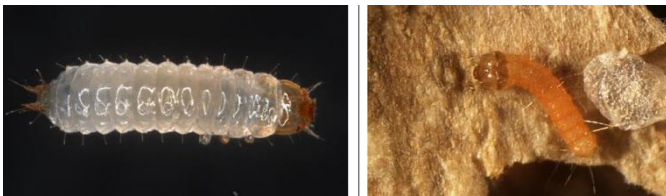
Figure 2. Carpophilus truncatus larva on left and carob moth larva on right.

NB: Carpophilus truncatus larvae are white, whereas carob moth larvae are pink (Fig. 2).