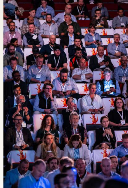
Photos: Australian Almond Conference 2024

Key note addresses Trade exhibitions and poster displays Closing drinks